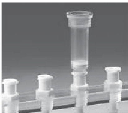
Fig. 1. Standard configuration for a vacuum manifold system fitted with RNeasy microcolumns. This approach allows the processing of large volumes of RNA extraction buffer (e.g., >5 ml) through the silica membrane without the use of a centrifuge.